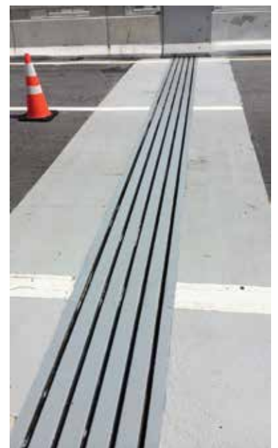
Doshin Modular Expansion Joint: 40 meters