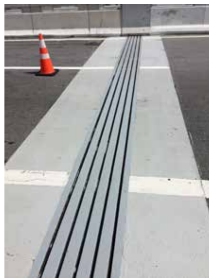
Doshin Modular Expansion Joint