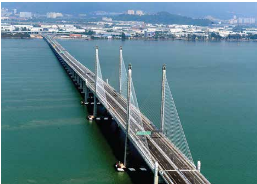
Doshin Modular Expansion Joint: 366 meters