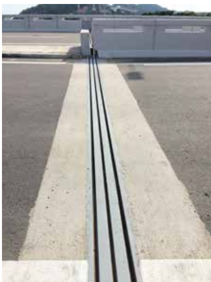
Doshin Modular Expansion Joint

Doshin Modular Expansion Joints are highly durable, have no loose or moving steel parts thus totally eliminating it from damages due to frequent load changes. Lubricated PTFE, high-grade stainless steel, elastomeric components and plastics plays a part in enabling the movement of the Doshin Modular Expansion Joints.