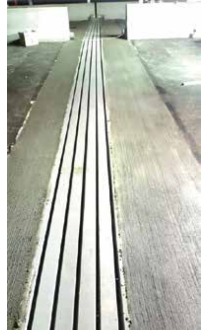
Doshin Modular Expansion Joint: 40 meters