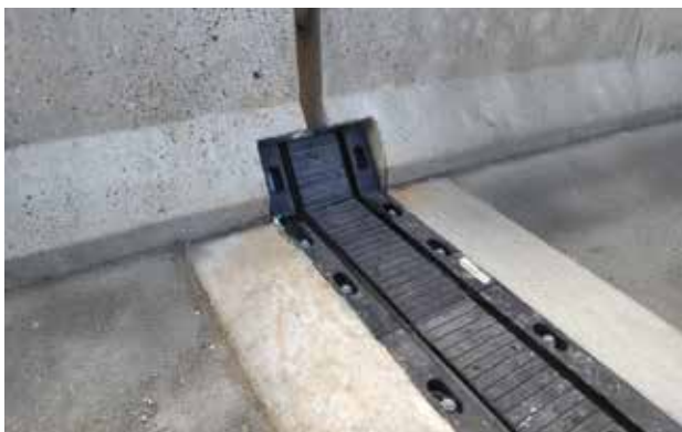
UPTURN WITH SKEW JOINTS