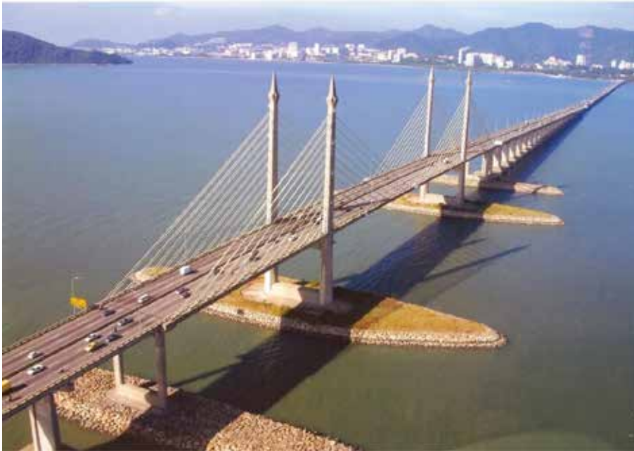
Doshin Modular Expansion Joint: 70 meters